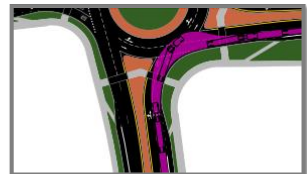
Making a right turn