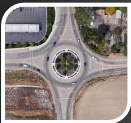
Amity/Happy Valley Nampa