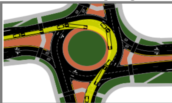
Making a left turn

Maneuvering single- and multi-lane roundabouts in large trucks and oversize vehicles