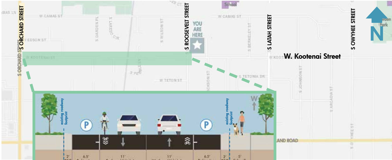
Existing: Kootenai Street - Roosevelt to Orchard - Facing West