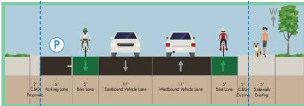
Option 3: Bike lanes