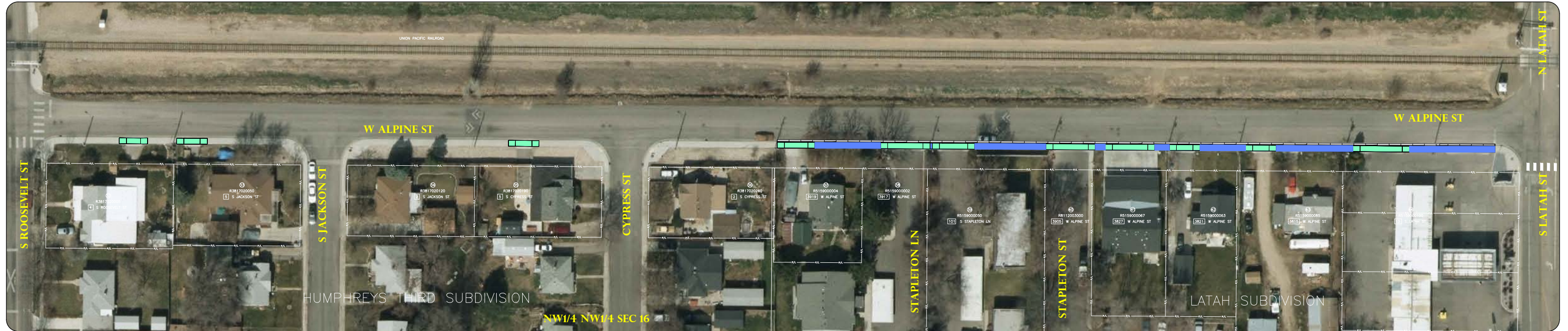
ALPINE STREET SIDEWALK CONCEPT