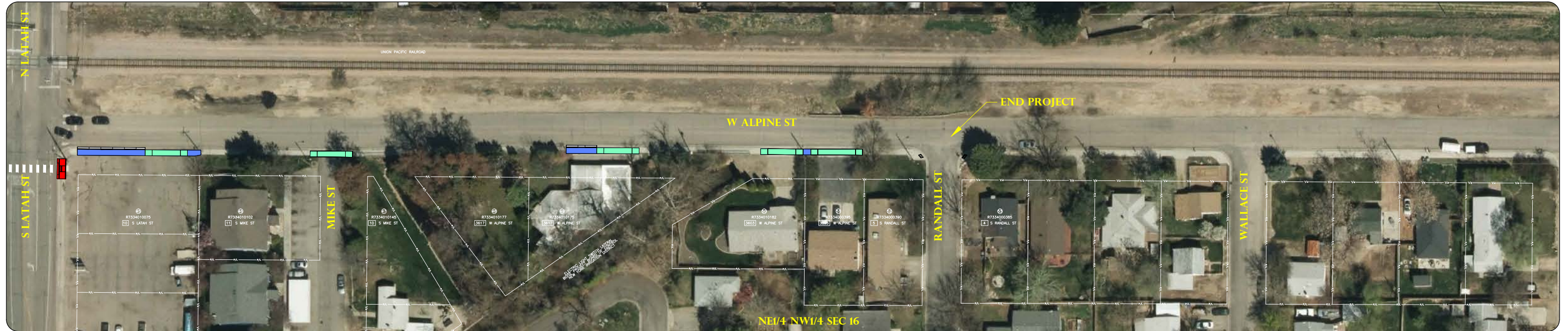
ALPINE STREET SIDEWALK CONCEPT