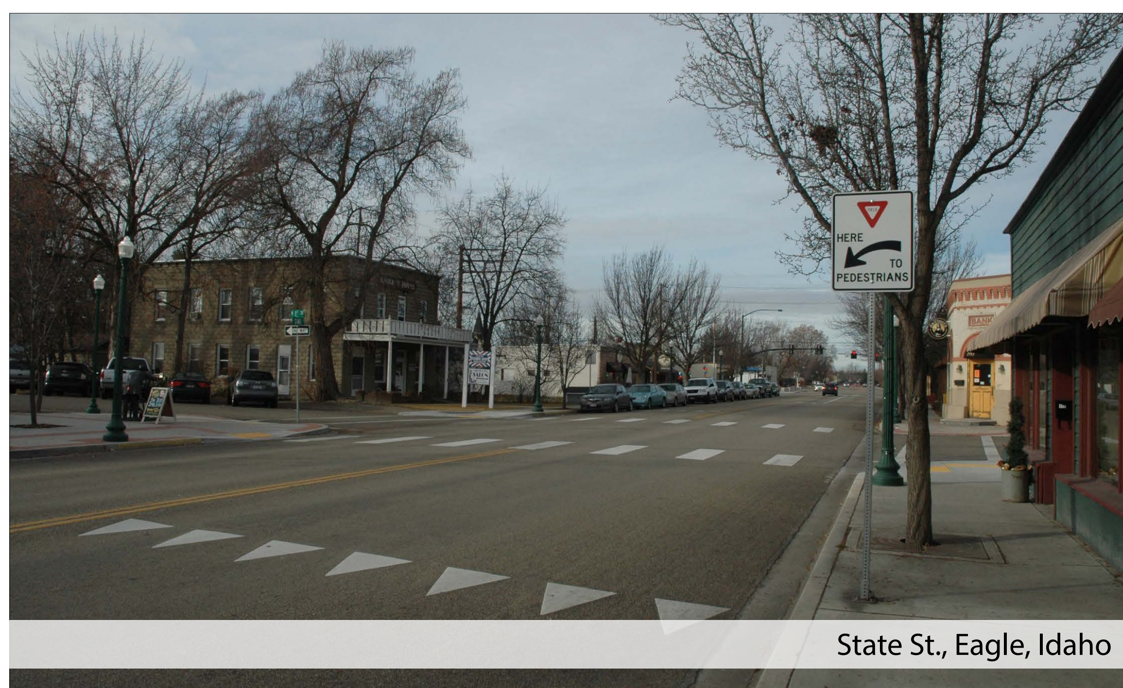
State St., Eagle, Idaho